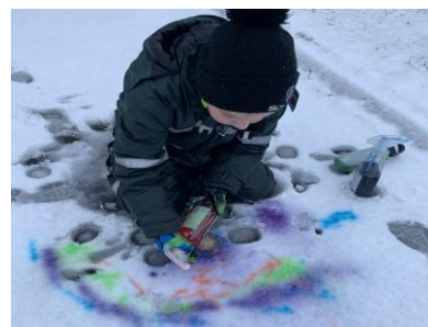
Mrs Pattinson has been very creative, designing some very original 'snow' art!