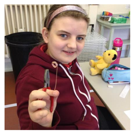
Learning new skills in Y7, DT.