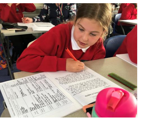
Demonstrating creative flair in English.