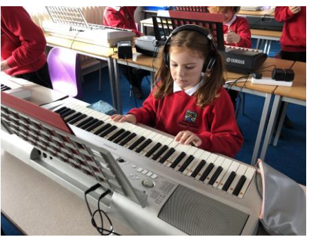
Developing musical talents in Y6 keyboarding sessions.